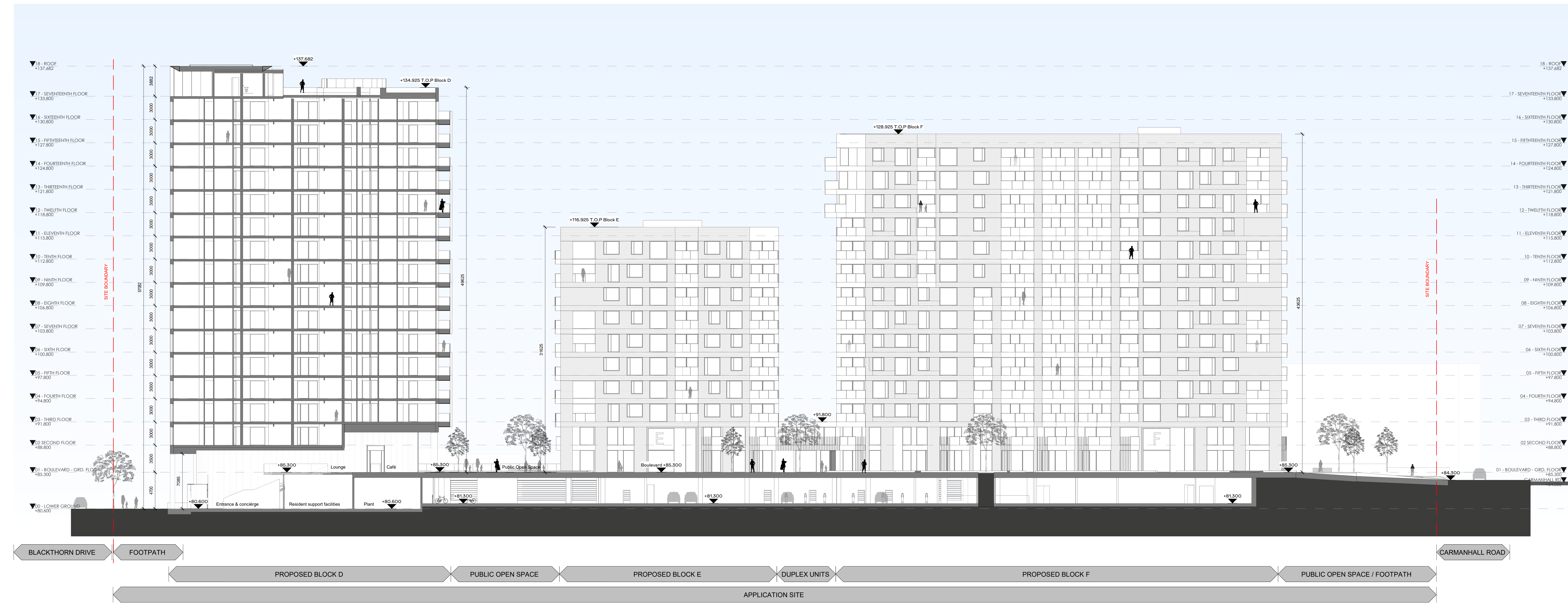
05 Section 05 1:500